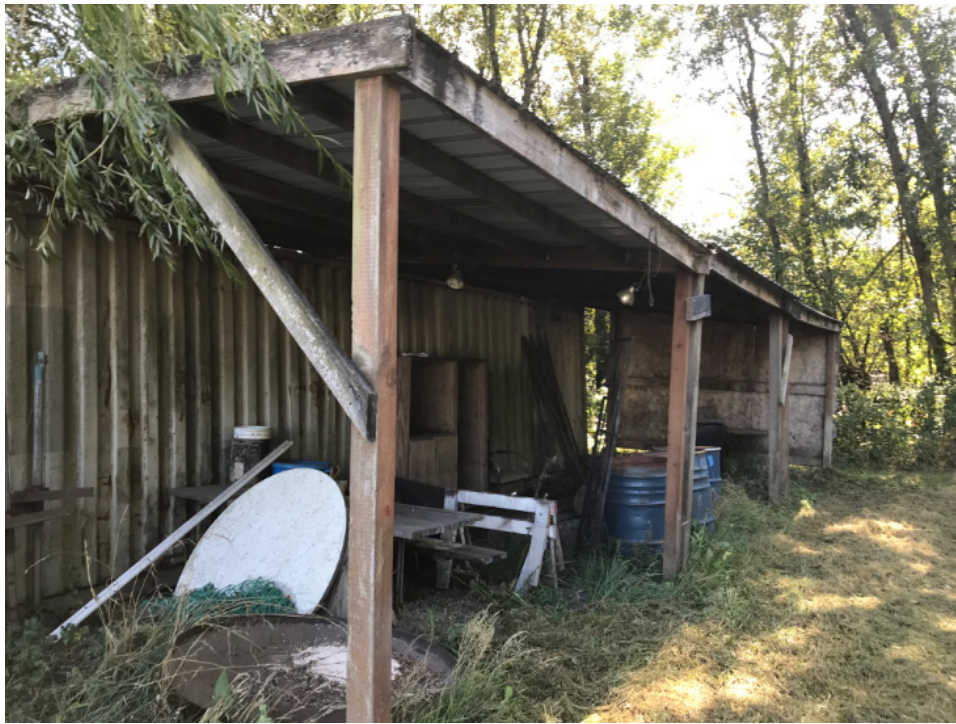
Photograph 9: Shed