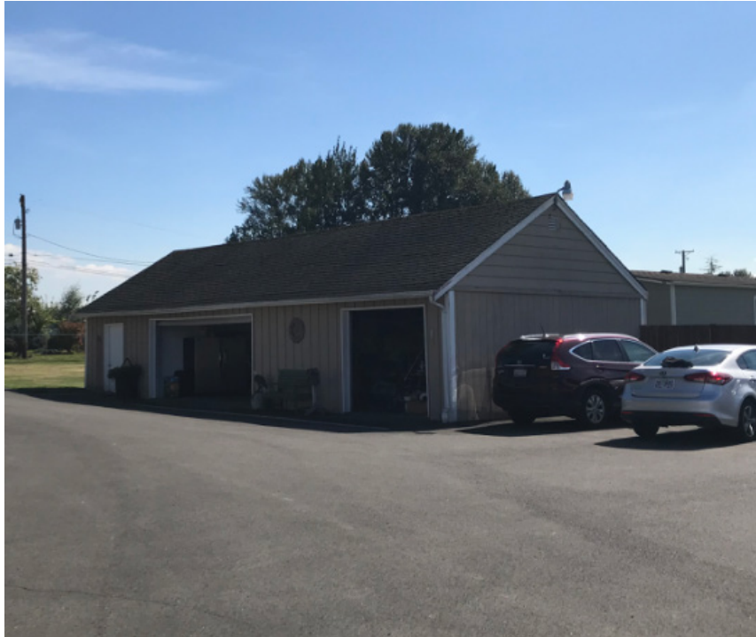
Photograph 10: Garage Exterior