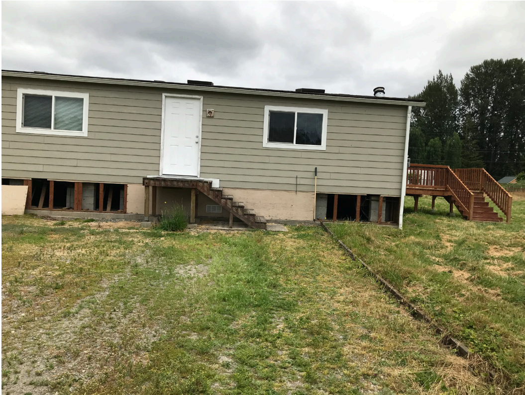
Photograph 20: Manufactured House - Exterior