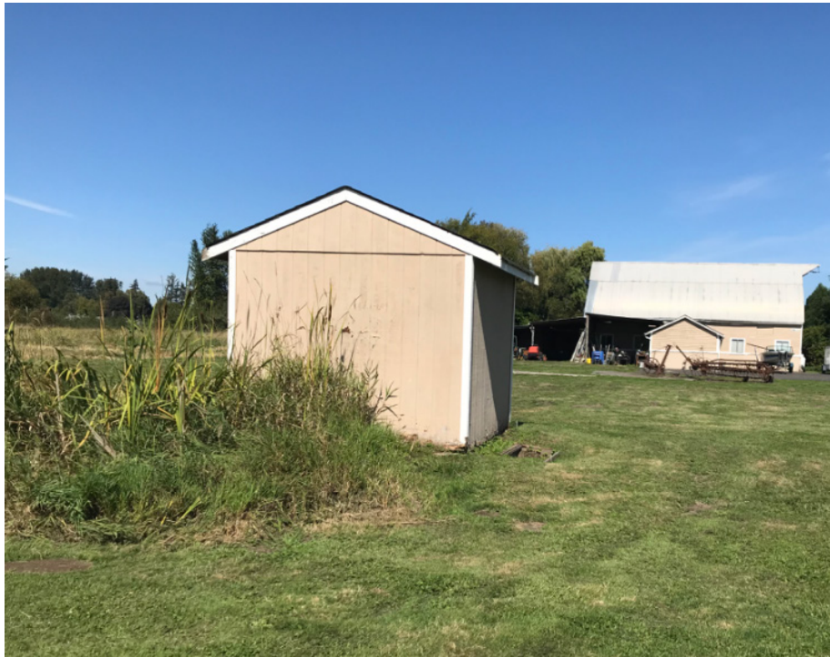
Photograph 19: Pumphouse (Barn in Distance)